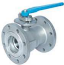
一片式法兰球阀 1-PC Flanged Ball Valve