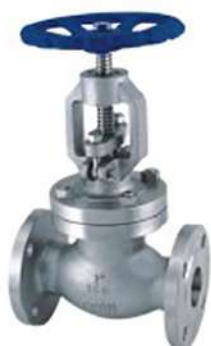
美标截止阀 API Globe Valve