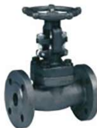
截止阀 Globe Valve