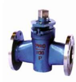
国标旋塞阀 Plug Valve