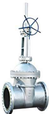
法兰闸阀 Flanged Gate Valve