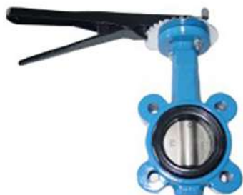
对夹式蝶阀 Wafer Butterfly Valve