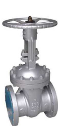
API闸阀 API Gate Valve