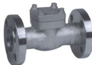
止回阀 Check Valve