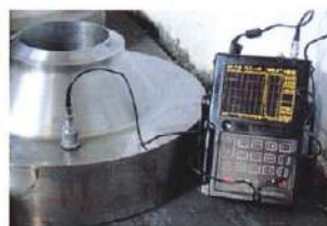
超声波检测 Ultrasonic Testing