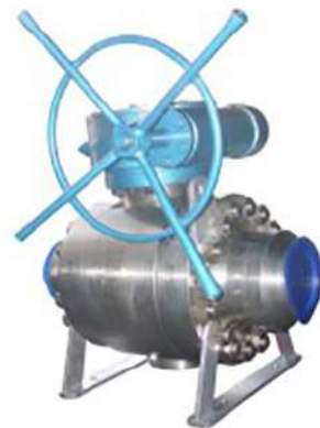
高温高压硬密封球阀 Hard Sealing Ball Valve