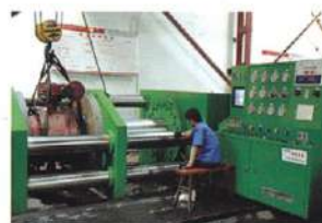
压力测试 Pressure Testing