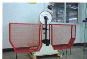
材料冲击试验 Material Impact Test