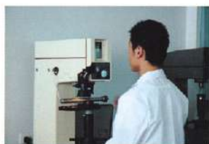
硬度测试 Hardness Testing