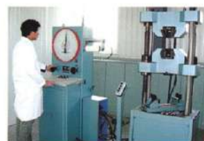
机械性能测试 Mechanical property Testing