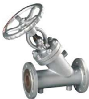
夹套保温截止阀 Jacketed Insulation Globe Valve