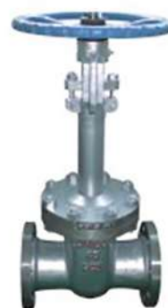
低温阀门系列 Cryogenic Valve