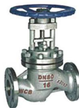
波纹管截止阀 Globe Valve