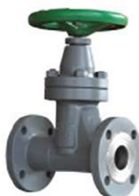
液氯阀 Liquid Chlorine Valve