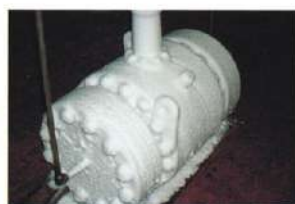
低温测试 Low Temperature Testing