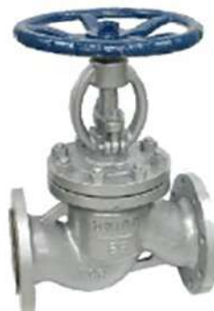
截止阀 Globe Valve