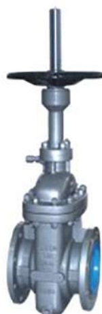
平板闸阀系列 Flat Gate Valve