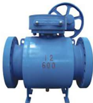
管线球阀 Pipeline Ball Valve