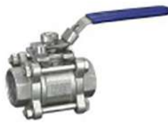
三片式球阀 3-PC Ball Valve