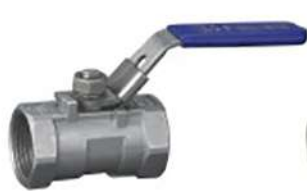
一片式球阀 1-PC Ball Valve