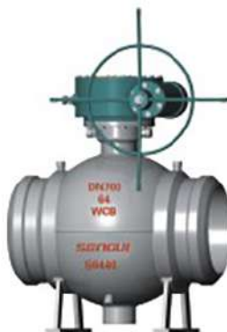
全焊接球阀 Welding-Structure Ball Valve