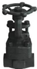
闸阀 Gate Valve