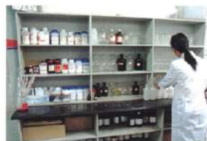
化学试验 Chemical Tests