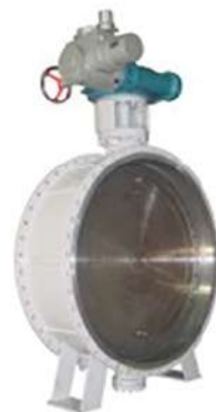
电动蝶阀 Electric Partial Butterfly Valve