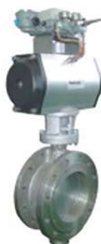
气动蝶阀 Air Operated Butterfly Valve