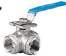
三通球阀 3-Way Ball Valve