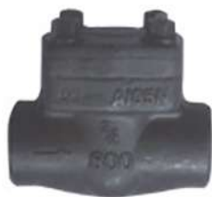
止回阀 Check Valve