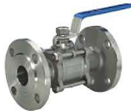
三片式法兰球阀 3-PC Flanged Ball Valve