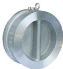
对夹双瓣旋启式止回阀 Double-disc Swing Check Valve