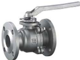
二片式法兰球阀 2-PC Flanged Ball Valve