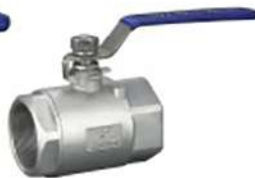
二片式球阀 2-PC Ball Valve