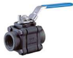
三片式高压球阀 3-PC High Pressure Ball Valve