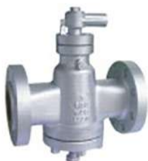
美标旋塞阀 Plug Valve