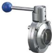
卫生级蝶阀 Sanitary Butterfly Valve