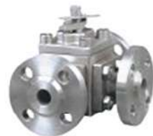
三通法兰球阀 3-Way Flanged Ball Valve