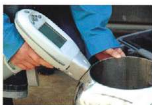
光谱分析 Spectrum Analysis