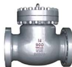
美标止回阀 API Check Valve