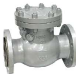
旋启式止回阀 Swing Check Valve