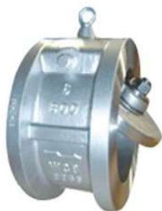
对夹单瓣旋启式止回阀 Single-disc Swing Check Valve